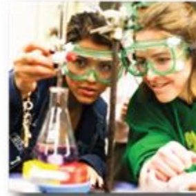
Albuquerque, New Mexico, U.S.A.