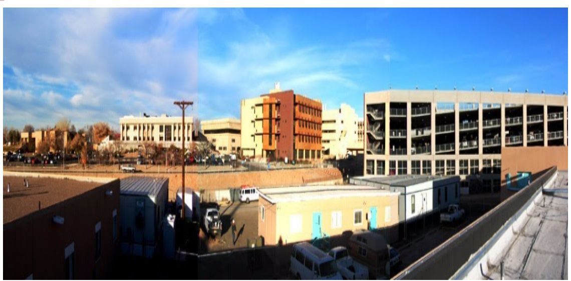
Undergrads! Be Ready for Fall Job Fairs in September!

Read the article here: <a href="https://medschool.duke.edu/about-us/news-and-communications/med-school-blog/diversify-faculty-start-here">https://medschool.duke.edu/about-us/news-and-communications/med-school-blog/diversify-faculty-start-here</a>